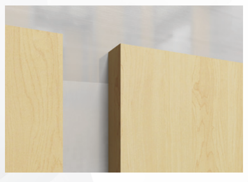
SELF EDGE (Laminate Only) Self edged plastic laminate edging.