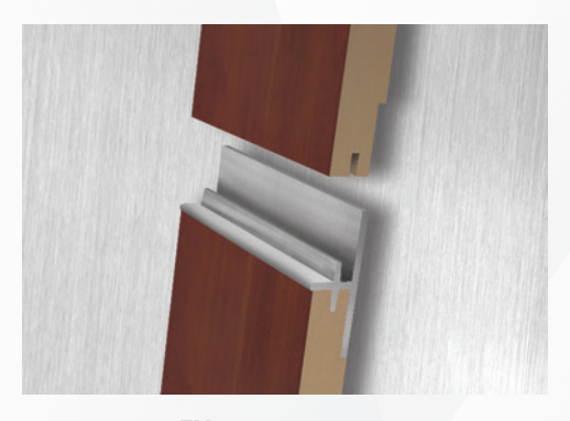
■ A-LOOK<sup>TM</sup> BINDER Patented A-Look<sup>TM</sup> Extrusion protects panel edges.