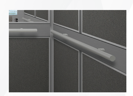
ROUND 1 1/2" Round handrail. 1 1/2" diameter brush finish stainless steel.