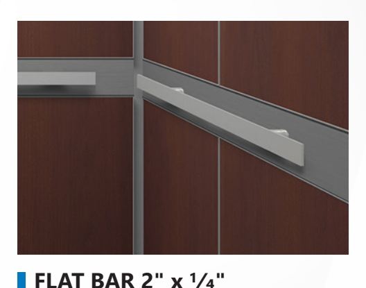
Flat handrail. 1/4" x 2" brush finish stainless steel.