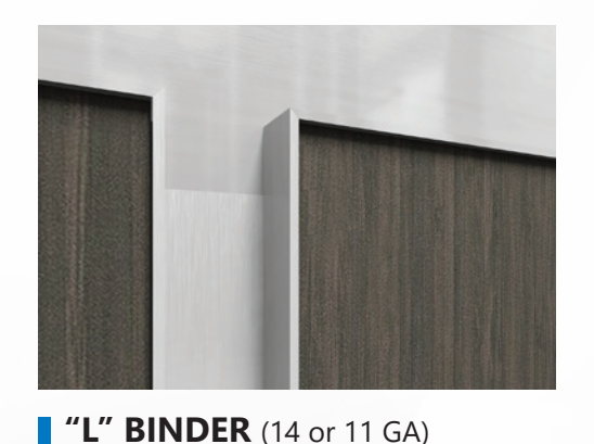
"L" Binders. 14 or 11 GA (1/8" thick) angle, stainless steel