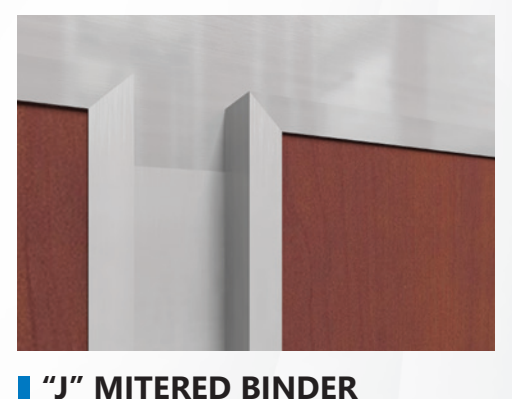
"J" Mitered Binders. 20 GA wrap around mitered corners, stainless steel.