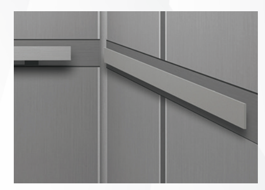
FLAT BAR 3" x 1/4" Flat handrail. 1/4" x 3" brush finish stainless steel.