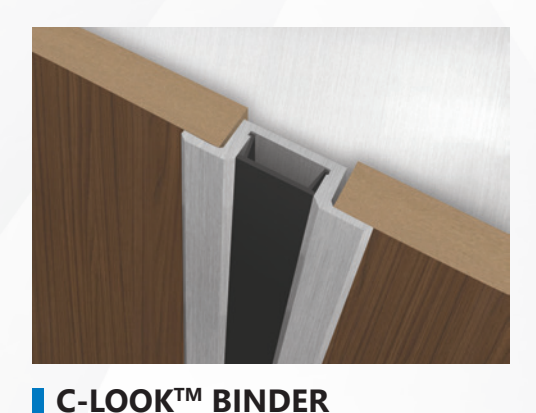
Protects panel edges. Black "glass reinforced" polycarbonate inlay.